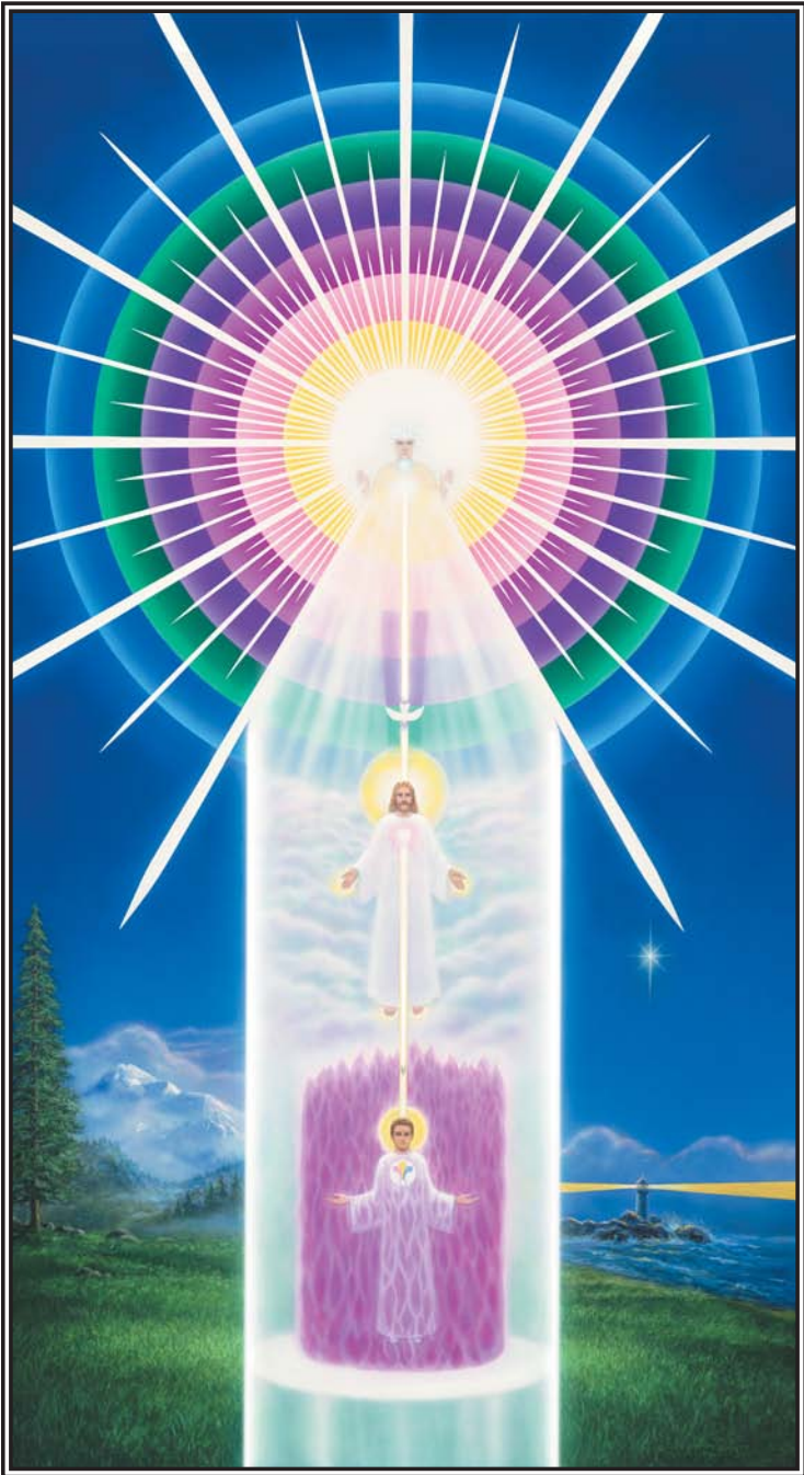
The Chart of Your Divine Self