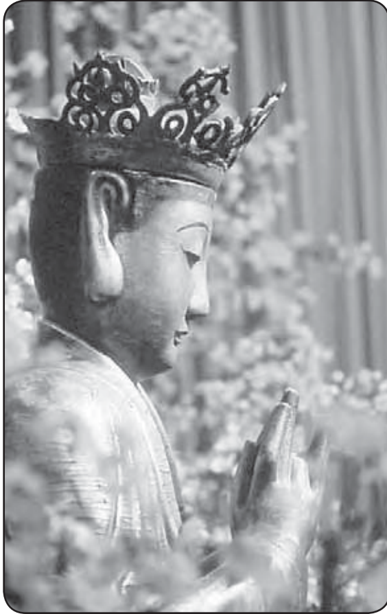
Crowned Buddha or Bodhisattva, life size, painted cloth over wood, around 350 years old. The crown symbolizes the Buddha's sovereignty and is sometimes used to depict Buddhas in the Body of Bliss. The topknot or cranial knob (Skt. usnisa) symbolizes his wisdom, openness and spiritual dominion as an enlightened being.